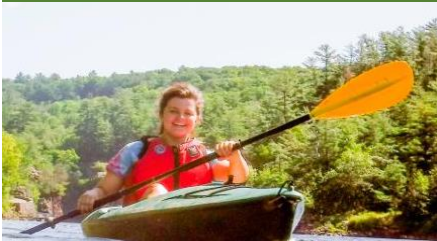
Recreation at St Croix NSR Top: Ice Age NST

Active outdoor recreation is an important part of the Wisconsin economy. The Outdoor Industry Association has found that active outdoor recreation contributes $17.9 billion annually in consumer spending to Wisconsin's economy, supports 168,000 jobs which generate $5.1 billion in wages and salaries and produces $1.1 billion annually in state and local tax revenue. The U.S. Census Bureau reports that each year 2.9 million people participate in hunting, fishing, and wildlife watching in Wisconsin contributing $3.9 billion to the state economy.