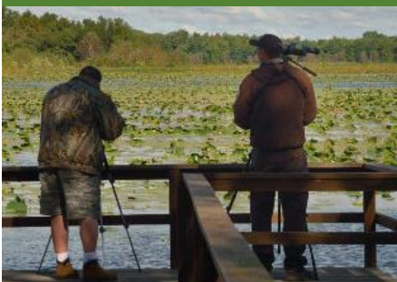
Wildlife Viewing at Patoka River NWR Top: Indiana Dunes NL

Active outdoor recreation is an important part of the Indiana economy. The Outdoor Industry Association has found that active outdoor recreation generates $15.7 billion in consumer spending in Indiana, 143,000 jobs which generate $4.3 billion in wages and salaries, and produces $1.1 billion annually in state and local tax revenue. Further, the U.S. Census reports that each year over 2.8 million people hunt, fish, or enjoy wildlife-watching in Indiana, contributing $2.2 billion in wildlife recreation spending to the state economy.