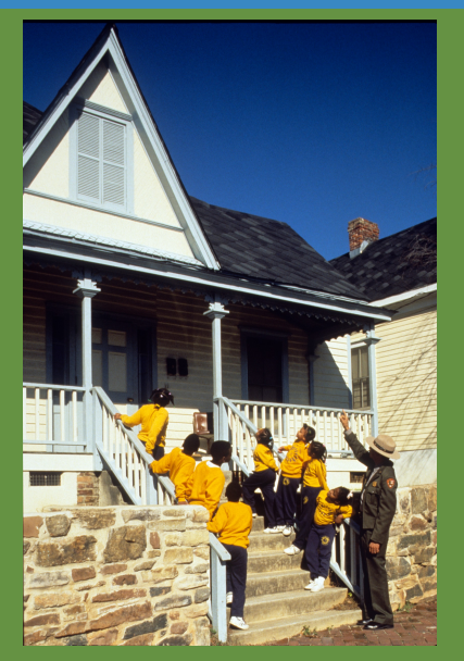
Student tour at Martin Luther King Jr NHS

LWCF is a simple idea: that a portion of offshore drilling fees should be used to protect important land and water for all Americans. These are not taxpayer dollars. Unfortunately, the promise of LWCF has been broken. The program is authorized to receive up to $900 million each year—but most of these funds have been diverted elsewhere. Now is the time to fix this and ensure that funds retained in the LWCF account are used for their intended conservation and recreation purposes.